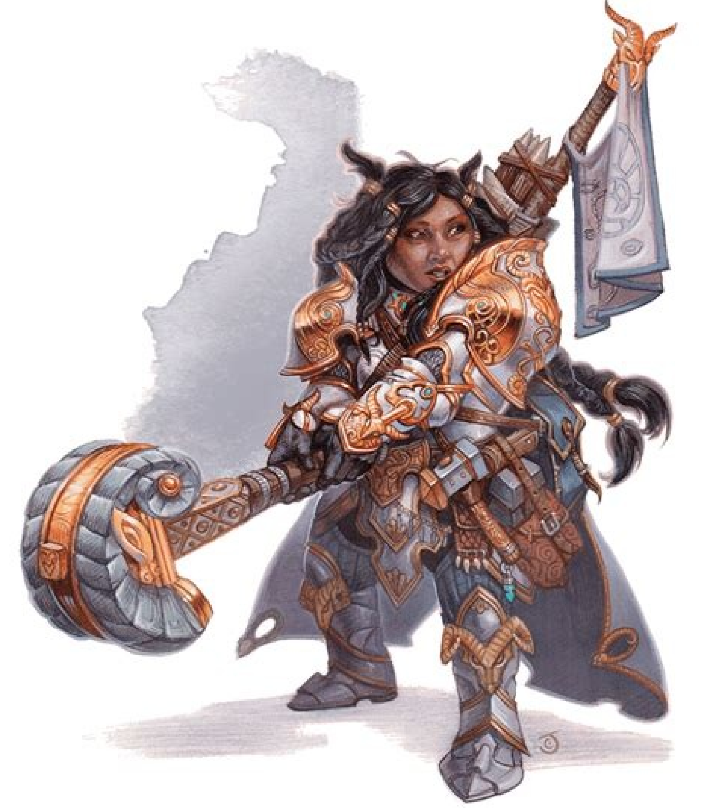
Cleric trickery domain 5e build.